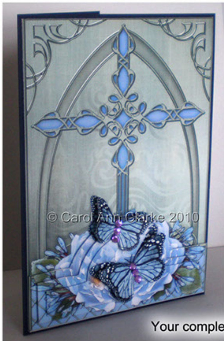
Your completed Card