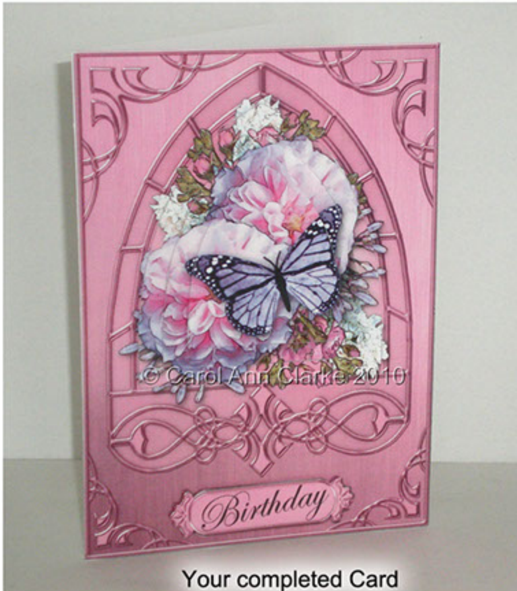
Your completed Card