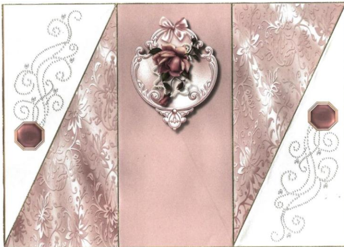
Card fully open/Insert