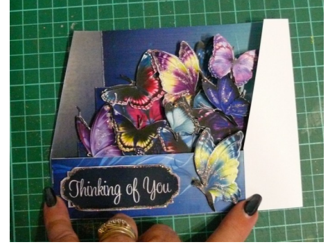
Folds flat for postage

Use a good glue when gluing layers in place so they don't separate.