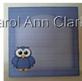
The back of your card

Add the head to the animation bar, sticking firmly in place.