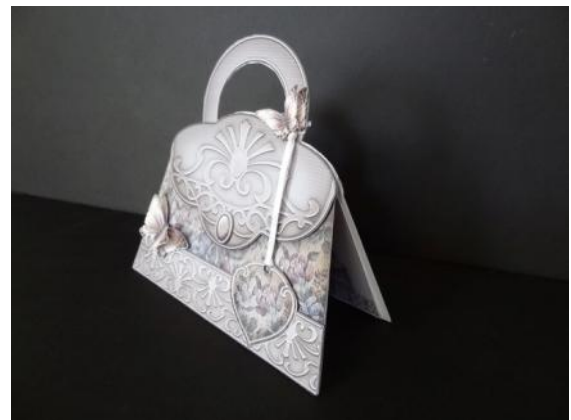
Fancy Handbag Card Side View