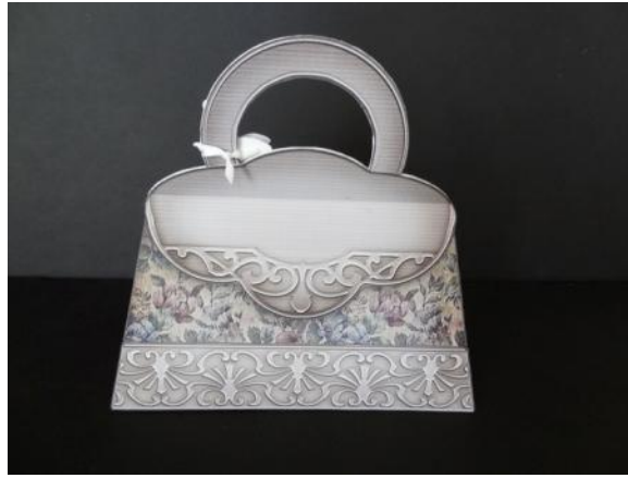
Back Fancy Handbag Card View