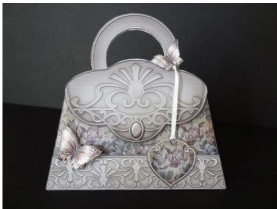
Fancy Handbag Card Front

3D Sticky Pads or Silicone Glue for decoupage and Double-sided Tape OR Glue