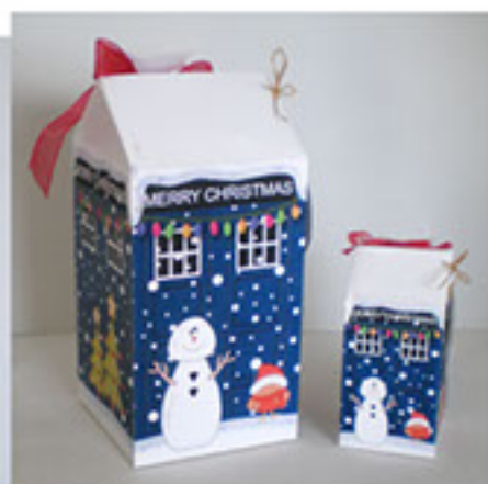
the back and sides of the boxes