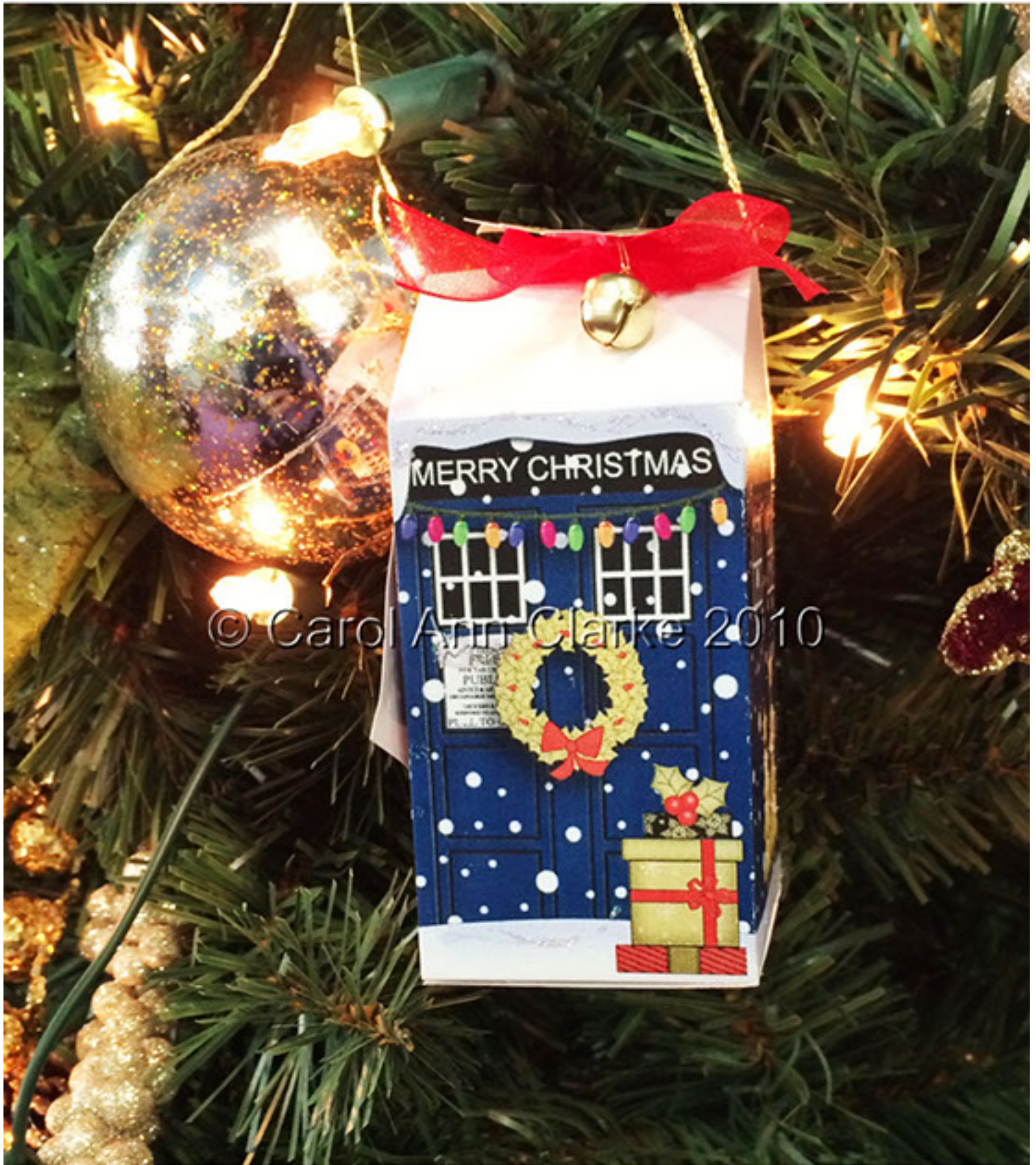
The Small Xmas Police Box looks fab hanging from the Christmas Tree or a Garland etc