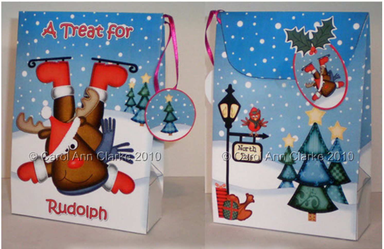
Your completed 3D Xmas Cookie/Treat Bag