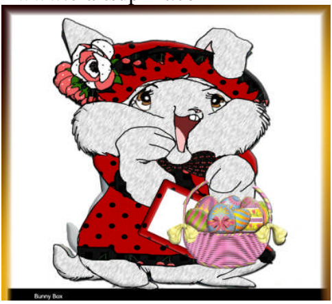
Rabbit Box Instructions – designer Lynne Crosskill for www.craftsuprint.com

1. Print out all pieces on good quality cardstock or photo paper.