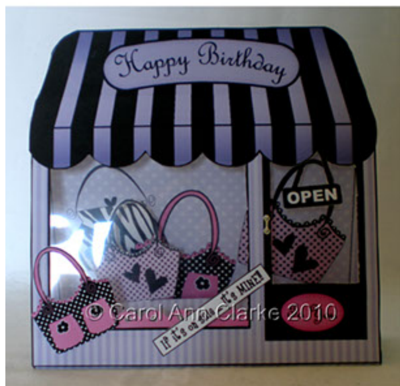
the back of your card

By adding a few of the extras in the kit and maybe a little bling from your crafty stash