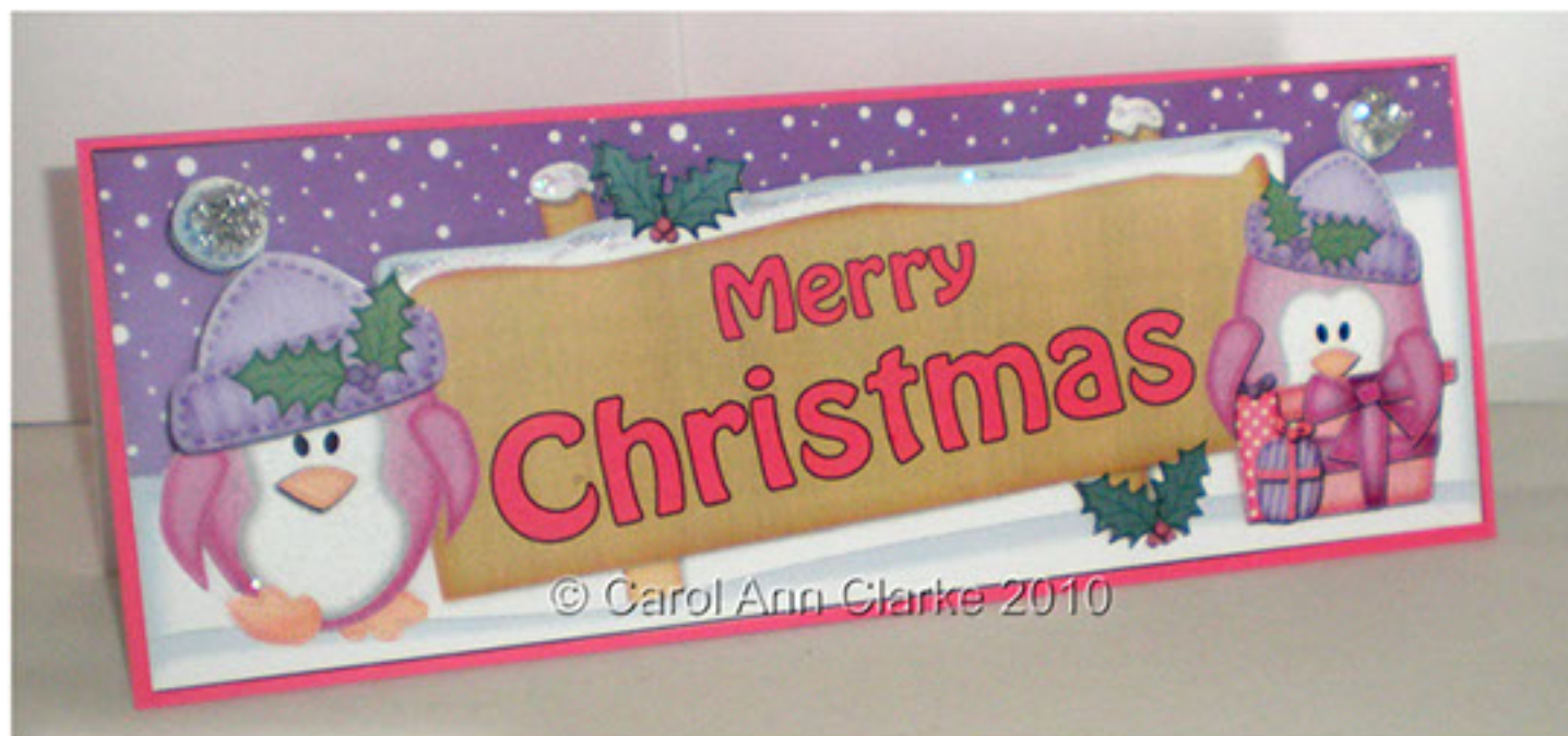
Your completed Card